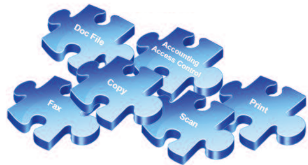
Application Programming Interfaces Sharp OSA® v4 Extended